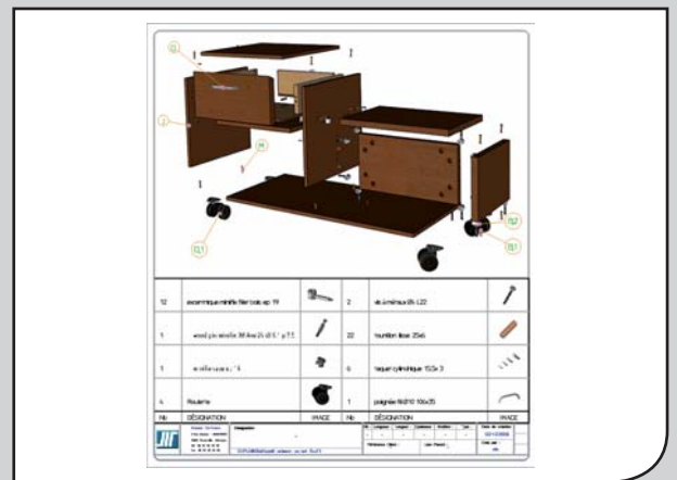
TopSolid'Wood 2009 proposes draft creation with enhanced BOM details.