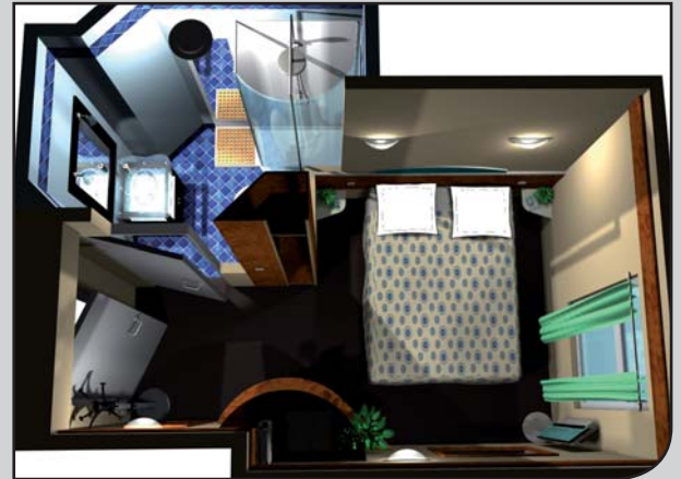
TopSolid'Wood offers tailored solutions for interior design.